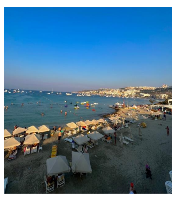
I also went to a spontaneous festival with other interns from the Inlingua language school.